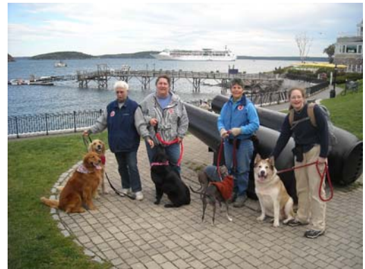
JDRF Walk - Juvenile Diabetes Research Foundation Walk - Mount Desert Island - Bar Harbor, Maine