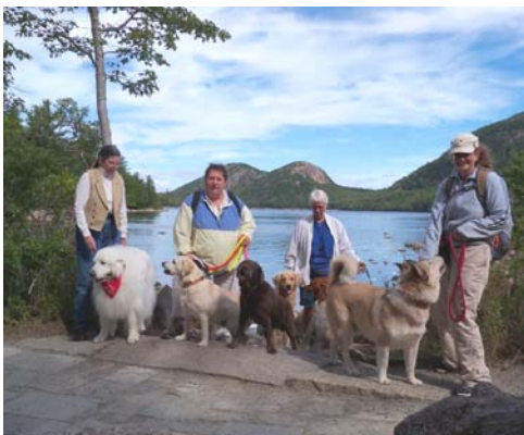
Left - Downeast Dog Scouts - Acadia National Park - Jordan Pond