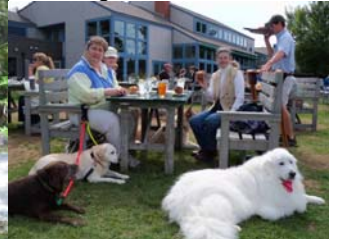
Acadia National Park - Lunch Jordan Pond House