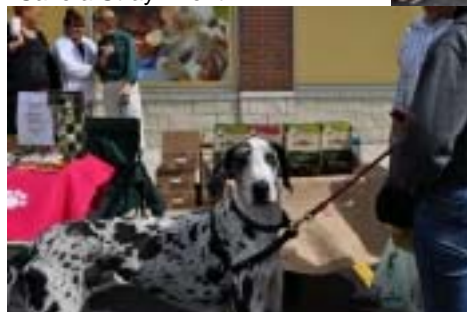
Left – Spot stopping by to find out about DSA