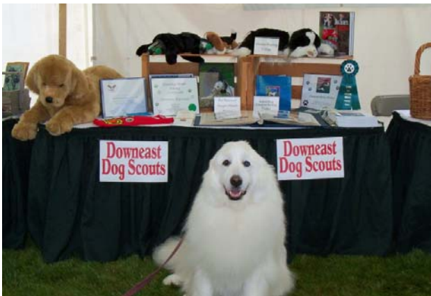
SPCA Fair - Hancock County SPCA Show and Fair, Northeast Harbor, Maine

Carriage Road Walking -Troop members continue to enjoy the New England fall foliage each weekend walking the Acadia National Park Carriage Roads. They are working toward completion of all 57 miles of the Carriage Roads to earn the Downeast Dog Scouts Carriage Road Certificate.