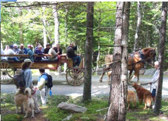
Downeast Dog Scouts - Acadia National Park - Carriage Road Walk