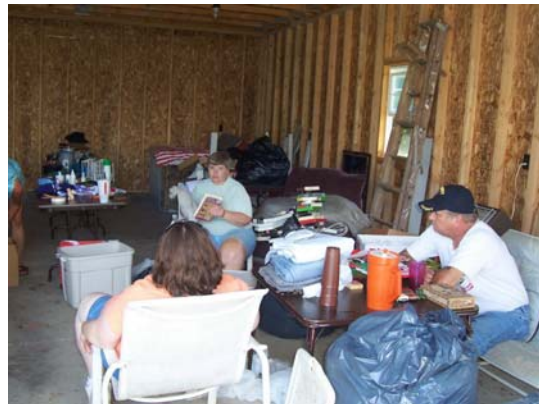
Left – Yard sale