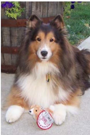
Sheryll Knipp (trail name Sirius Star Gazer) and dogs Stryker (Sun Dog), Venture (Little Bear) and Ryder (Shadow Walker), Troop #166