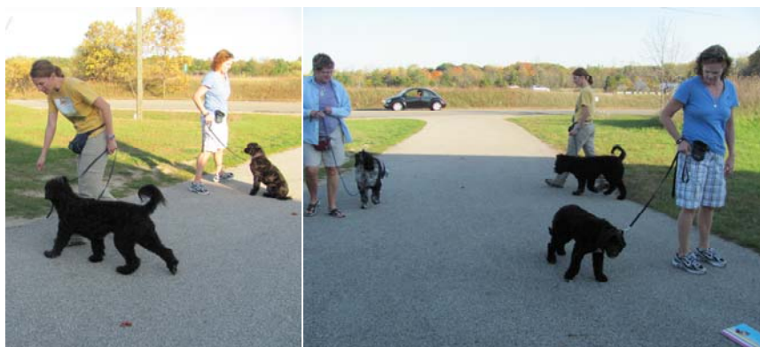
Above – DSA Class