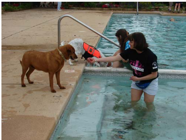
Alice decides if treats are worth getting wet.