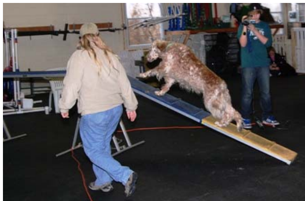
Summit masters the dog walk