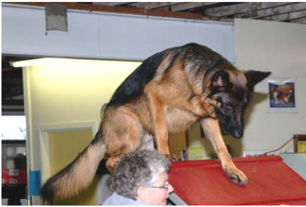
Harry reaches the top