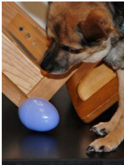
Pirate wants to know what is hiding inside

Our bottle drive is doing well with the Troop collecting over $50 dollars in returnables during the recent collection period. The money from this drive will help us by animal rescue breathing equipment for our local emergency crews. In May the troop will have a workshop on Canine CPR and we will also be presenting our first batch of rescue breathing equipment.