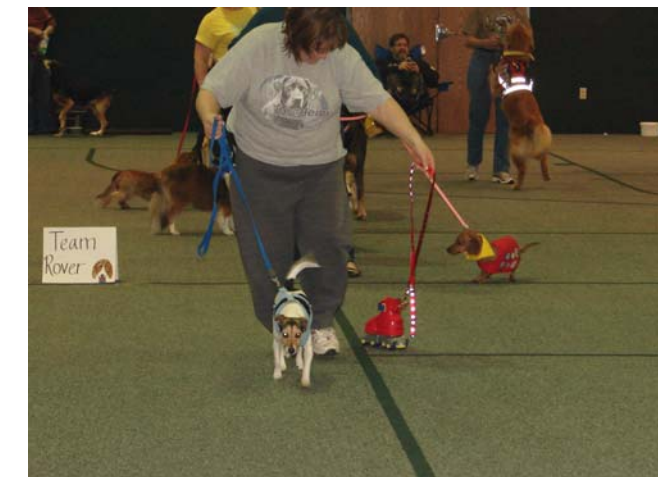
Denise and Daisy speed skate.