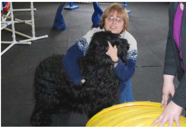
Bling does her first tunnel