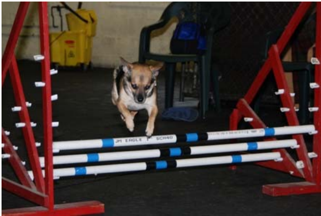
Pirate shows his form over the spread jump