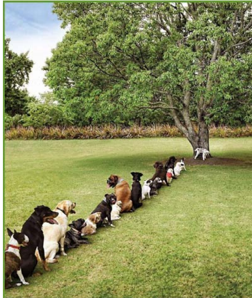
Another problem caused by deforestation