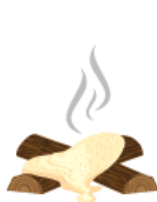
Sand or dirt

Put out the fire by cutting one of the sides of the fire triangle. You can do this by covering it with sand or dirt, dousing it with water or letting wood burn out. Make sure it's cold before you leave!