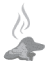
Let wood burn out