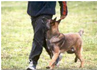
Large dog in proper heel position

This is NOT simply loose leash walking. The dog must demonstrate that it understands the heel cue by working to remain in heel position while the owner demonstrates the following movements in this sequence (based on diagram below); 20' in a straight line, right turn, 10' in a straight line, stop and cue the dog to sit (cue not required), 10' in a straight line, about turn, 20' in a straight line, left turn, 10' in a straight line, stop and cue the dog to sit (cue not required), 10' in a straight line and stop. The dog may be asked to sit (cue not required) to finish the exercise.