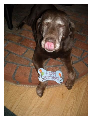
Left - Happy Birthday Rissa!! Dog Scout Rissa celebrates her fourteenth birthday on September 29th!!!