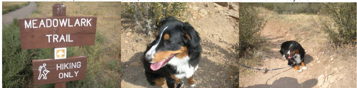
Pictured Left to Right: Entrance to trail, Seven Montilla-Goad, Ace Montilla-Goad Meadowlark Trail August 26, 2012

Todd Goad, Julie Montilla-Goad, Ace and Seven "scouted" the trail for the next day events.