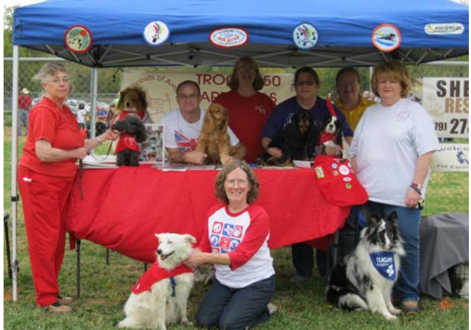
Presenting new Dog Scouts in 2012: Alice, Claire, Cricket, Do-G, Poppy, Sampson

Our troop members are active with other dog groups including therapy (nursing homes, school reading programs) and dog rescue work, and have been able to present information about the Dog Scouts of America at other dog club meetings during the year. Our troop also tries to get the word out with an informational booth at local dog events, so here we are at a shelter fundraiser. We love to share our enthusiasm for Dog Scouts, and the Power of Positive Training!