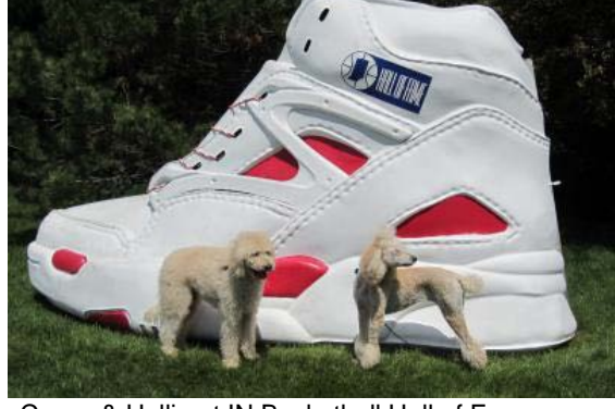
Casev & Hallie at IN Basketball Hall of Fame