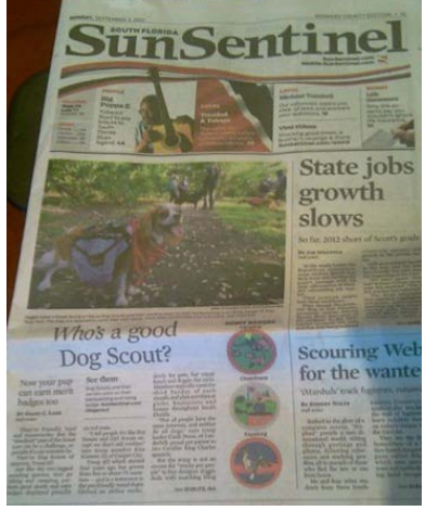
Left - News Paper Cover - Having fun practicing sit stays during a game of Tic Tac Toe at our member meeting.