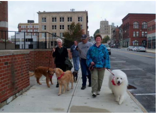
Paws on Parade - Photos above

On Saturday October 6<sup>th</sup> Downeast Dog Scouts Troop members joined Team Kindred Spirits for the Bangor Humane Society's Paws On Parade fundraiser in Bangor, Maine. Raya, Rebel and Cirra walked the one mile plus downtown route with hundreds of other great dogs on a fun fall day in Maine. Team Kindred Spirits was the top fundraising team for the Bangor Humane Society, raising $8,900!