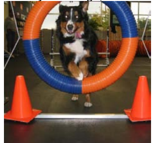
Pictured above: Seven