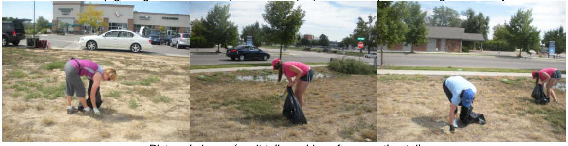
Pictured above: (can't tell one hiney from another lol)

Our Troop got together to clean up the field to prepare for Responsible Dog Owner Day.