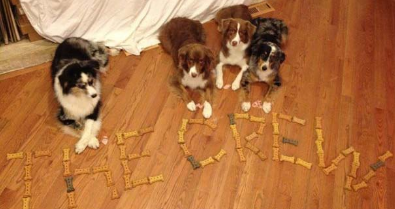
Kelly Ford, Dog Scout Troop 219 Leader