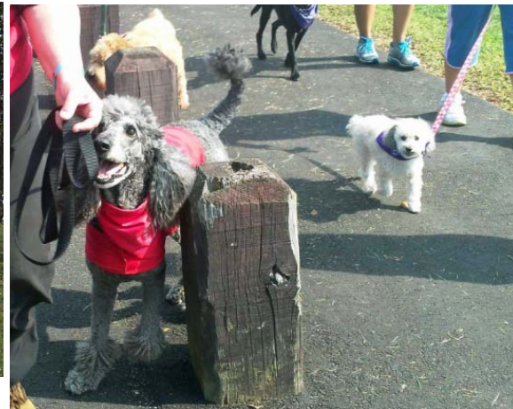
Photos - Top- Walking the Walk; Top Right – Lucy Leads a weave during a lap of the walk; Bottom Right- Phantom shows his support for the Bark For Life.

In addition to Autumn's Festival, and Bark for Life Troop 188 had a booth at a couple of additional events including a local positive training center's client appreciation day. While there we talked to folks about the Dog Scout Way, responsible pet parenting, and helped with a scenting activity. Not to be outdone with outside activities Troop 188 also revamped our website <a href="http://dogscouttroop188.shutterfly.com">http://dogscouttroop188.shutterfly.com</a> and Facebook <a href="https://www.facebook.com/DogScoutTroop188">https://www.facebook.com/DogScoutTroop188</a> presence. Stop by and check them out and let us know what you think!