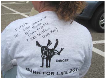
he Bark for Life shirts