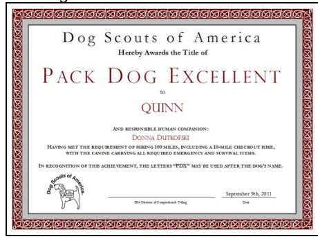
Quinn, with Donna Dutkofski

Recognizing the achievement of hiking a total of 100 miles, including one 10-mile checkout hike, with the dog carrying all required emergency and survival items, the following dogs earned the Pack Dog Excellent title – the second of our three PackDog titles.