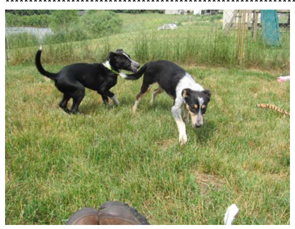
Photo left - Sage and Cassie, the rescued herding Dog Mixes. Sage is the Black and white and Cassie is the Tri colored.

The Rogue River Dog Scouts Troop had a blast this summer. We were having so much fun we forgot to write. Now Fall is upon us, all the kids are back in school, and we are hitting our "slow time" of the year here at Rogue River.