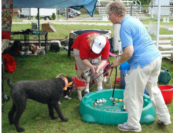
Photos below, left to right: My Dog's Place Clients trying to retrieve ducks from the duck pond.