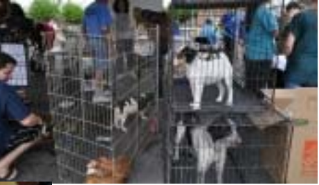
Left – Spot stopping by to find out about DSA