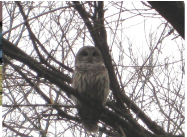
Owl found geocaching