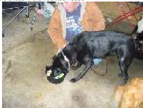
Kevin Witmyer with Gracie doing the cauldron grab