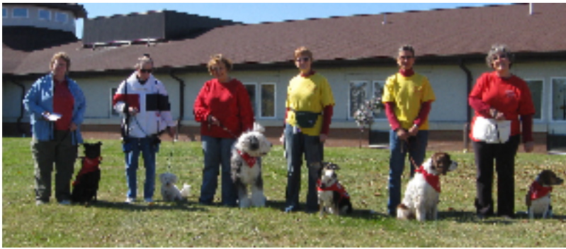
Troop 149 Drill Team