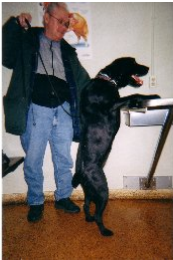
Chelsea trying to jump on the vet's table.