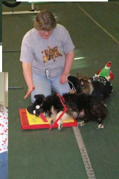
Left - Stryker as a pirate