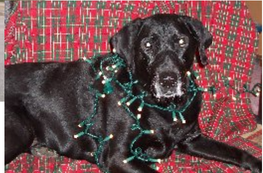
For 2008 Christmas card.