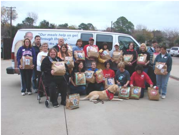
Picture – Packing up the MOW Van.