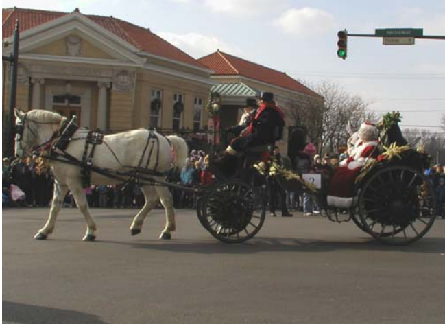
3) ("Carriage parade 1") Participant in the Lebanon Carriage Parade.