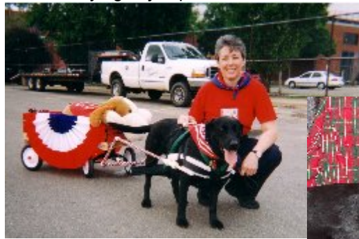
Chelsea pulling a cart in a parade.