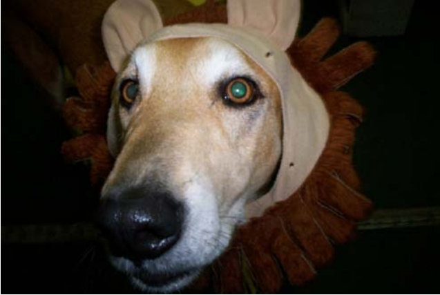
Happy Halloween from Troop 166